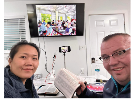
Teaching can be a challenge with a 12-hour time difference

We are thankful for the Word of the Lord! This year we were able to hold 13 week-long trainings for our pastors and leaders - 8 of them were online sessions and 5 in-person trainings. We felt led of the Lord at the start of the year to begin a study through the entire book of Acts. Each training produced a contextual synopsis and outline; list of applicable lessons; verse-by-verse commentary and a minimum of three sermons from each section studied during the training. When we are finished with the book, each student will have a wealth of information that will enable them to accurately and powerfully preach and teach from the book of Acts.