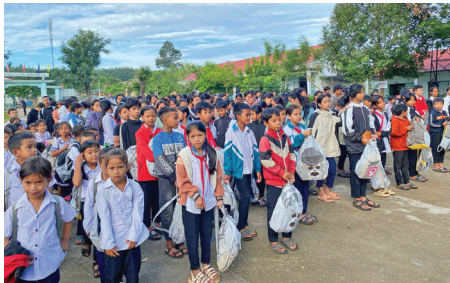
Handing out backpacks at a school in the Highlands

Our pastors were blessed this past year with opportunities to minister to their communities in a number of ways. Thanks to your support, food bags went to the needy; filled backpacks and jackets when to school children; VBS blessed orphans and touched thousands of lives; Christmas events brought New Believers into God's family. The five different teams that joined us on the mission field last summer helped with a number of these outreach events as well as encouraged our pastors and leaders through trainings and testimonies. Everyone returned home feeling more blessed than those they had come to bless. There is nothing we cannot accomplish when working for the Lord!