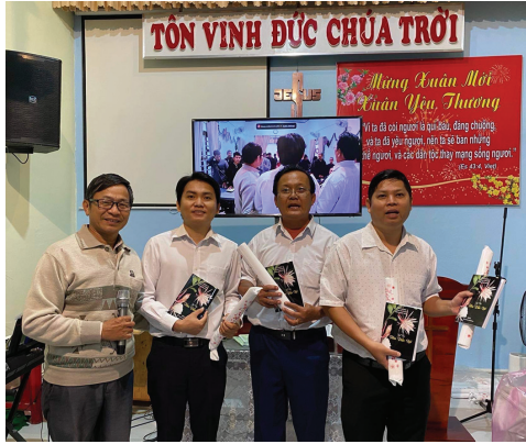
Training in the Central Region

We are thankful for the Word of the Lord! This year we were able to hold 13 week-long trainings for our pastors and leaders - 8 of them were online sessions and 5 in-person trainings. We felt led of the Lord at the start of the year to begin a study through the entire book of Acts. Each training produced a contextual synopsis and outline; list of applicable lessons; verse-by-verse commentary and a minimum of three sermons from each section studied during the training. When we are finished with the book, each student will have a wealth of information that will enable them to accurately and powerfully preach and teach from the book of Acts.