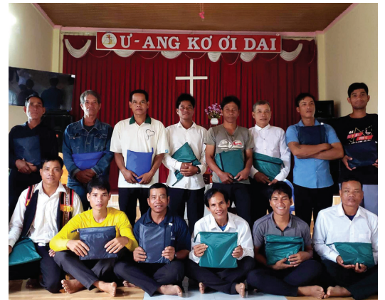
Above - Pastors in the Tribal Highlands

SALM67 Ministries exists to partner with national pastors and leaders throughout the nation of Vietnam to reach their country for Christ. We equip them to do this by training them, encouraging them through fellowship and giving ongoing financial support. Over the last couple of years, we have felt a burden in this ministry because many of our pastors are experiencing financial difficulties. Because of Covid, many have had to take on unwanted debt in order to provide for their families. Now that Covid is over, they are having to pay back that debt and while they feel the call on their life to serve the Lord, they have a real responsibility to care for their families by paying off these debts. This has been an ongoing struggle for so many of our pastors and we would really like to ease their burden. Currently 25 pastors receive support from his ministry at a level that provides for some needs ($50/month) but does not really allow them to get out from under debt. Our goal this year is to not only expand the number of pastors we support but increase the amount of that support ($150/month) as a way to bring them some measure of financial peace and allow them to continue serving the Lord. Please reach out to us if you would like to partner with us in this specific way.