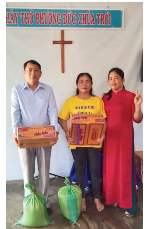
Food bags in Quang Ngai

Last year at this time, we were able to put some resources in the hands of our pastors to bless their community at the Lunar New Year (TET). They distributed 450 food bags while delivering the message of the Gospel in churches throughout the nation. The Lord really used this tangible reminder of God's love for His children as three were led to surrender their life to the Lord after hearing of God's saving grace.