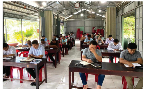
Training in the South