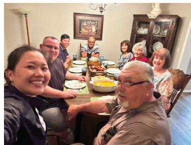
Fellowshipping in Two Egg