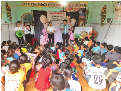
Children enjoying VBS