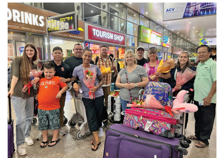
Arrival of the team from The Springs Church who proved themselves resilient and adaptable as they worked diligently for the Lord in spite of a number of unforeseen obstacles