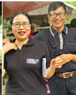
Left - A few of the pastors we work with in the South and Central Regions. Very often the wives are instrumental to the success of these ministries